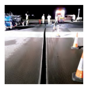
RAF Barkston Heath