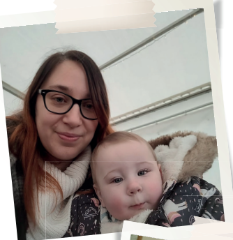
Head of Quality Assurance