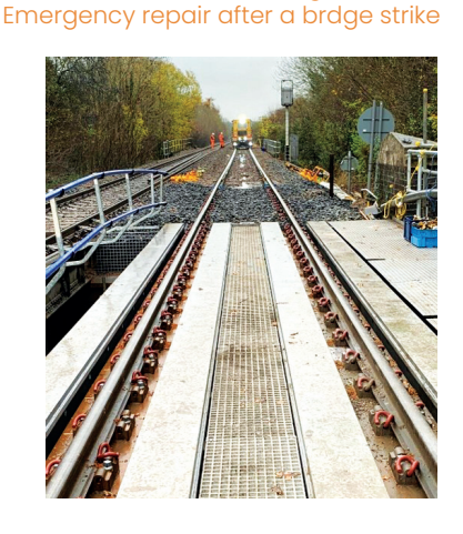
Fosters Bridge PMJ/58:

The strong relationship between our procurement team and our supply chain helps us to control the safety, speed and quality of the required repair response, making sure that important plant and materials are available and supplied quickly and safely. This is crucial for our clients and our success provides them with confidence. Over the last year we have seen a massive increase in major emergency call outs such as Fosters Bridge, Wakefield Viaduct and Kirkstall Wall. All these sites were mobilised and operational within 24 hours with the Eastern, Asset Management Team on site within a few hours and plant and materials swiftly following. This collaborative teamwork has been recognised by winning the National Rail Awards, Team of the Year category and CECA Yorkshire & Humber Linda Grant H&S and Going the Extra Mile awards alongside our client Network Rail.