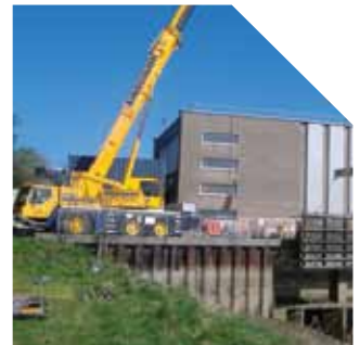
Altmouth Pumping Station – Refurbishment of Penstocks Phase 2