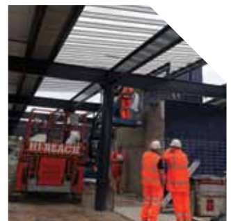
Blackburn Railway Station Access For All & Station Improvement Programme